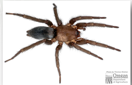
The mouse spider (Scotophaeus blackwalli), a common spider found in Oregon.

Spraying pesticides is generally not very useful nor is it generally necessary. Most of the time, short-term relief is all that is achieved since most of the available pesticides are effective for relatively brief periods and afterwards new spiders move